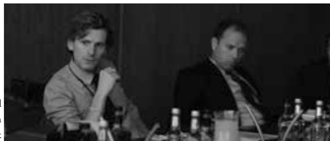
Still from Warbook