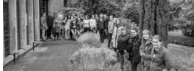
All of us who came to spend an enlightening weekend in Nottingham.